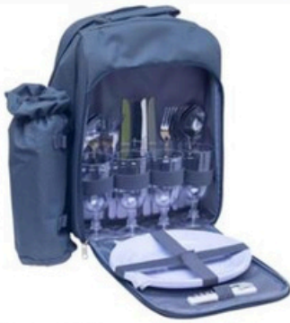
SB 4 SUNDOWNER backpack 4 persons