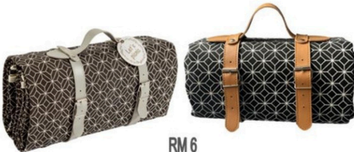
RM 6 Black geometric Available with grey or pebble straps