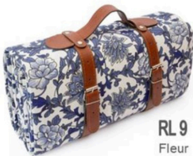
RL 9 Fleur