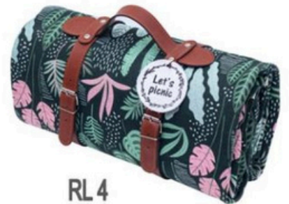
RL 4 Blossom