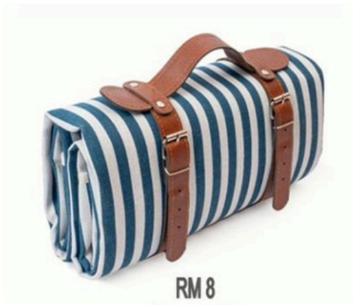
RM 8 Aquamarine