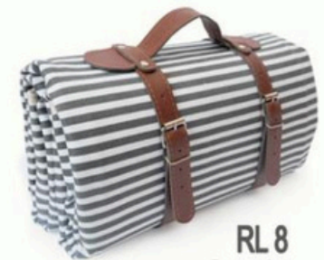
RL 8 Symphony