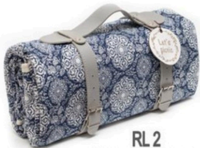
RL 2 Blue kaleidoscope