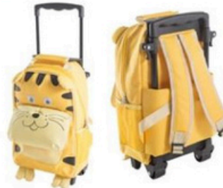
KD 1 Y KIDS trolley bag yellow