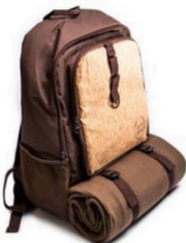
AD 1 b ADVENTURE backpack (4 person wooden cutlery incl; picnic blanket 1.3 x 1.2 m included)