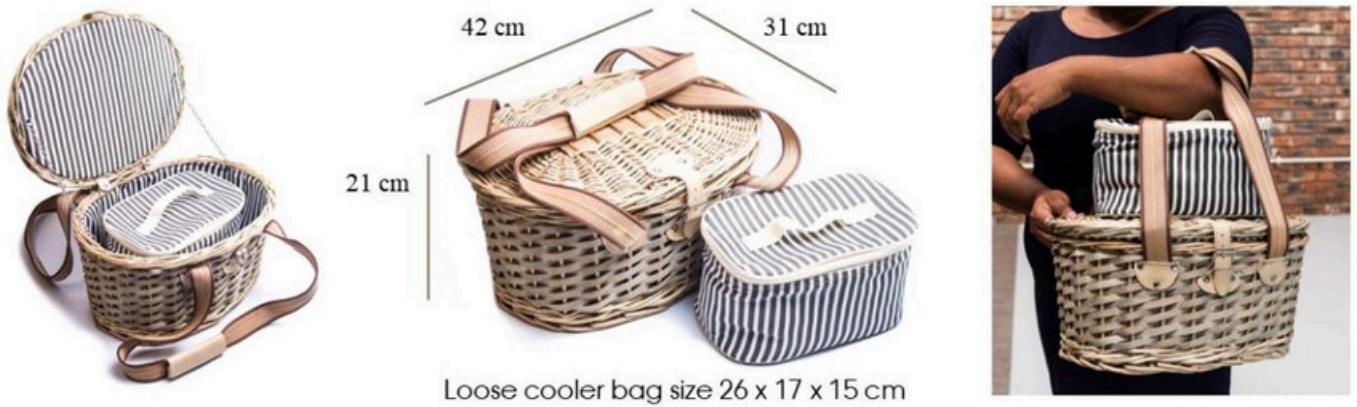
BA 11 b IVORY basket with wooden cutlery incl for 4 persons