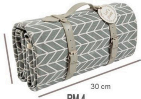
RM 4 French grey