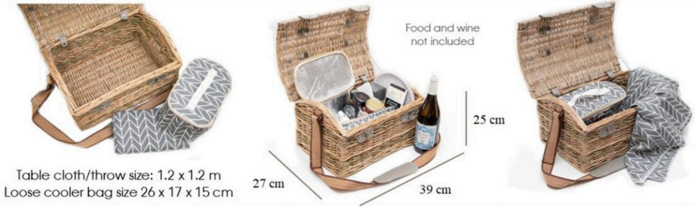
BA 10 b CLASSIC basket with wooden cutlery incl for 4 persons