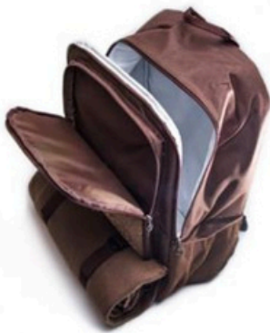
AD 1 a ADVENTURE backpack (no cutlery incl; includes picnic blanket 1.3 x 1.2 m)