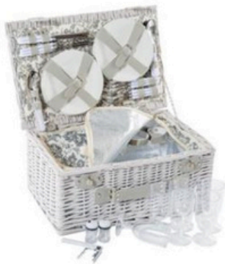
BA 1 FAMILY FEAST basket 6 persons Grey-washed wicker