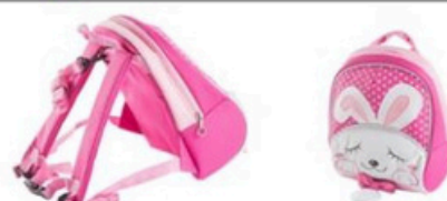
KD 3 KIDS lunchbox pink (backpack)