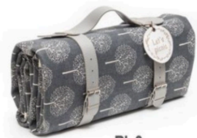
RL 3 Dark grey arbor