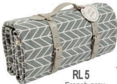
RL 5 French grey