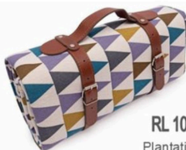
RL 10 Plantation