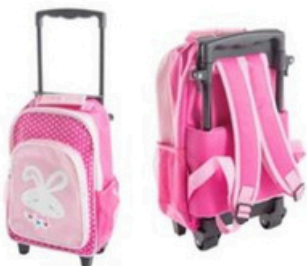
KD 1 P KIDS trolley bag pink