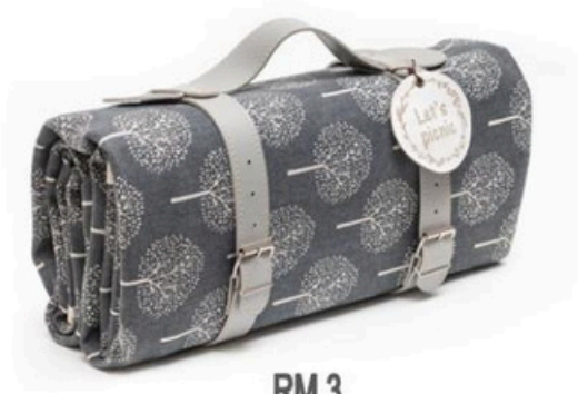
RM 3 Dark grey arbor