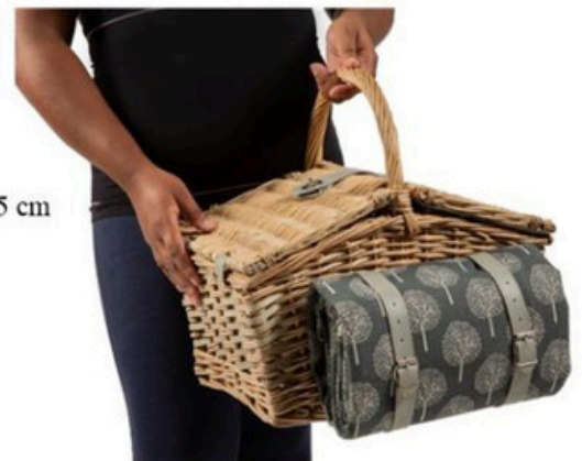
BA 12 FOREST basket 4 persons (drawstring bag and cheese board included)