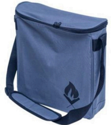
Carry-bag with sling - 30 x 32 x 12 cm

HP 19 EXPANDA MARSHMALLOW BRAAI FORK Telescopic stainless steel braai fork, neatly packaged in a protective cylinder packaging