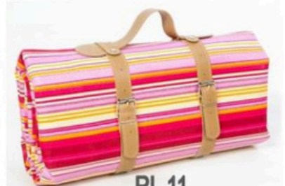
RL 11 Carnival