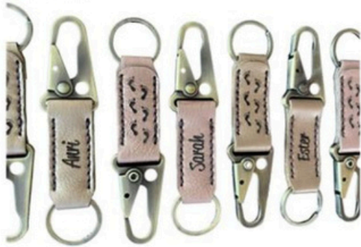
LG 34 Snap hook key rings

Manufactured on order. Lead times apply.