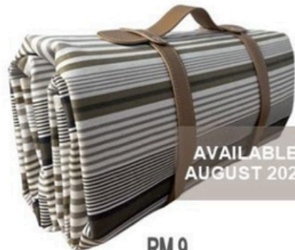
RM 9 Everest