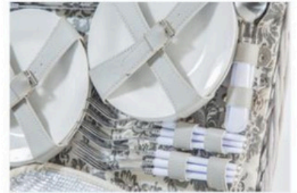
BA 2 FAIRYTALE basket set with rug, table cloth, wine bag and drawstring bag 5 persons