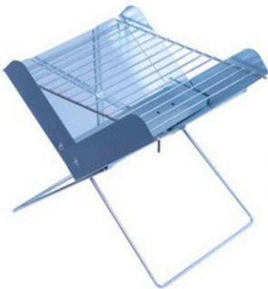
Open braai stand - 30.5 x 30 x 26.5 cm

HP 18 BRAAI-IN-A-BAG - foldable galvanized steel braai, fits neatly in a carry-bag with sling