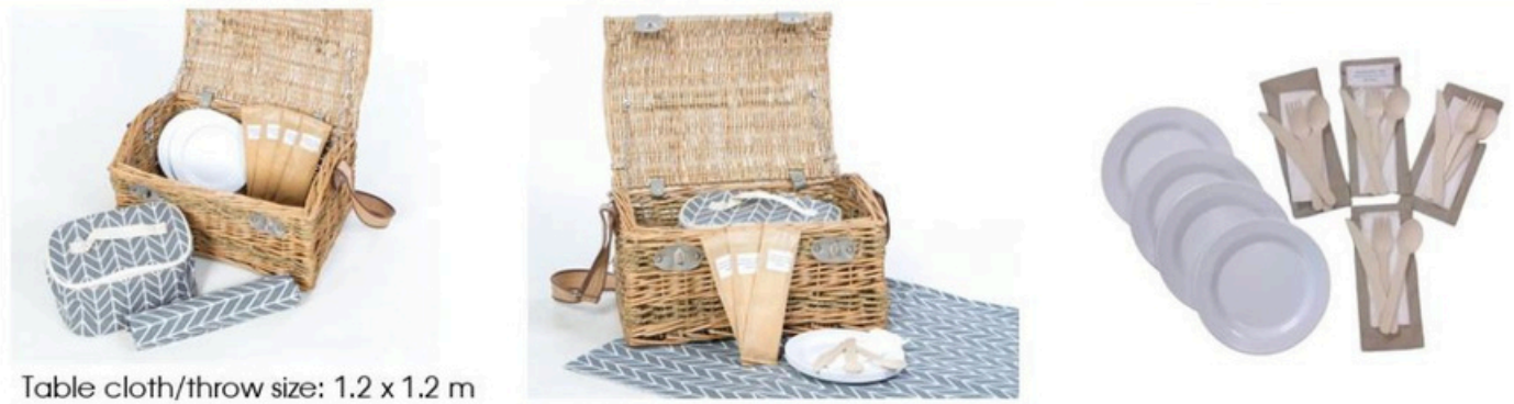
BA 11 a IVORY basket (no cutlery incl; small cooler bag incl)