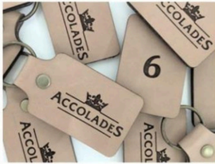
LG 21 Key ring tag Double sided