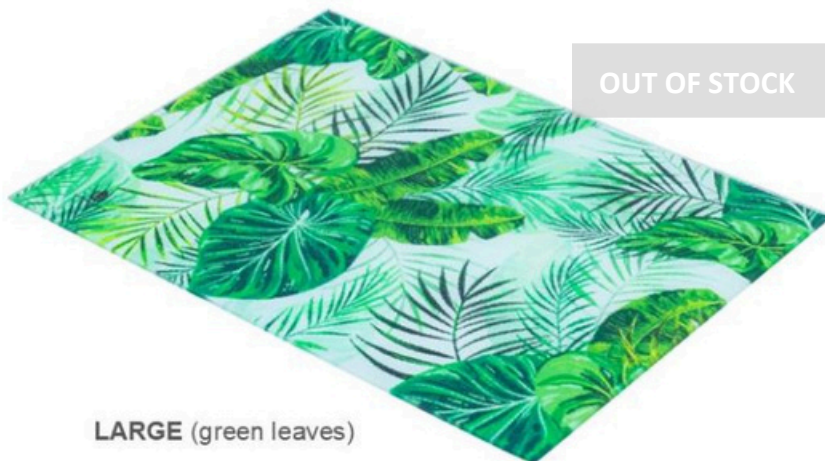
LARGE (green leaves)