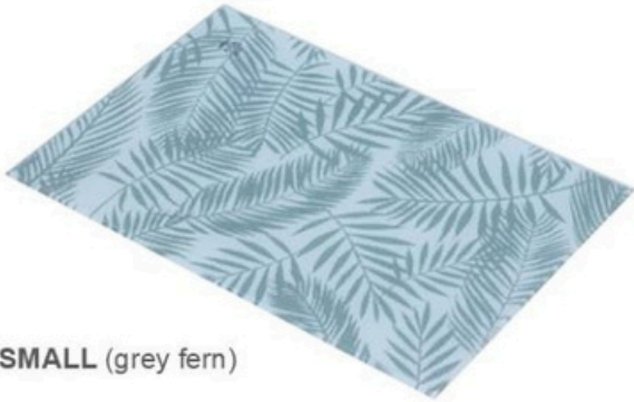
SMALL (grey fern)

HP 9 GLASS CUTTING BOARD LARGE - made from Stippolyte toughened glass - 38 x 28 cm Heat resistant, dishwasher safe and unbreakable