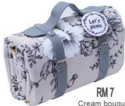
RM 7 Cream bouquet Available with grey or pebble straps