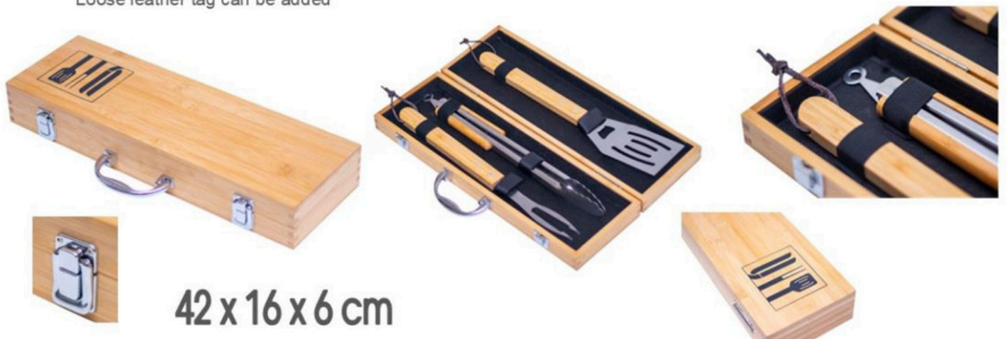
42 x 16 x 6 cm

HP 20 Bamboo case and 3 high quality stainless steel braai utensils (a premium gifting item) Loose leather tag can be added