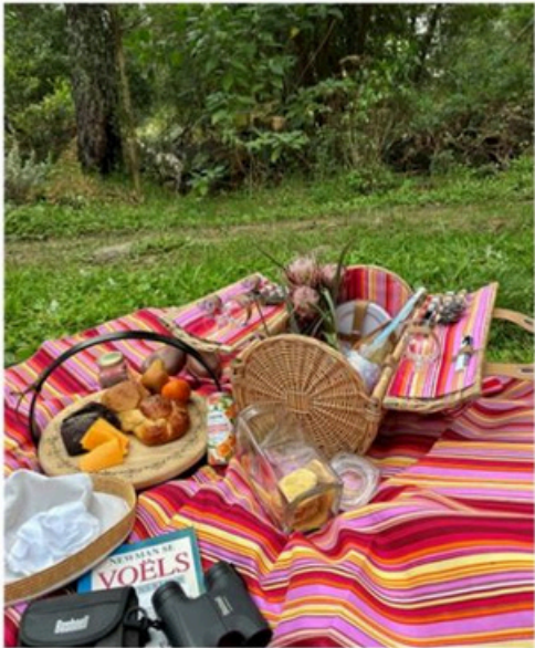
Picnic rug examples