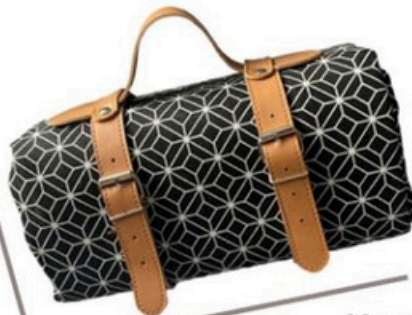
RL 6 Black geometric Available with pebble straps