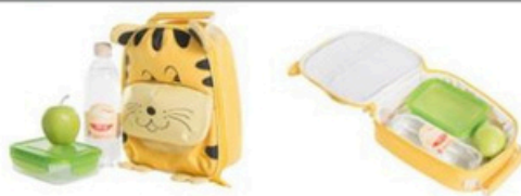
KD 2 KIDS lunchbox yellow (not a backpack)