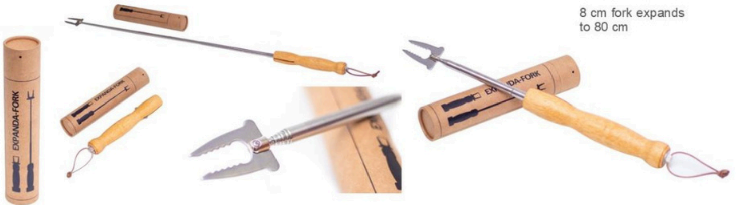
8 cm fork expands to 80 cm

HP 19 EXPANDA MARSHMALLOW BRAAI FORK Telescopic stainless steel braai fork, neatly packaged in a protective cylinder packaging